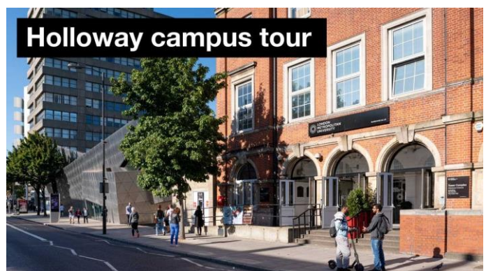
London Metropolitan University